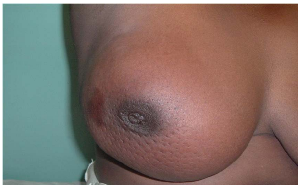
Figure A1. Enlarged right breast with peau de orange skin and nipple retraction.